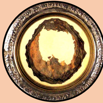
8th Century Miracle at Lanciano, Italy where host turned to heart tissue and wine to blood.

Highlighting 1800 years of miracles created by Blessed Carlo Acutis—as seen on EWTN.